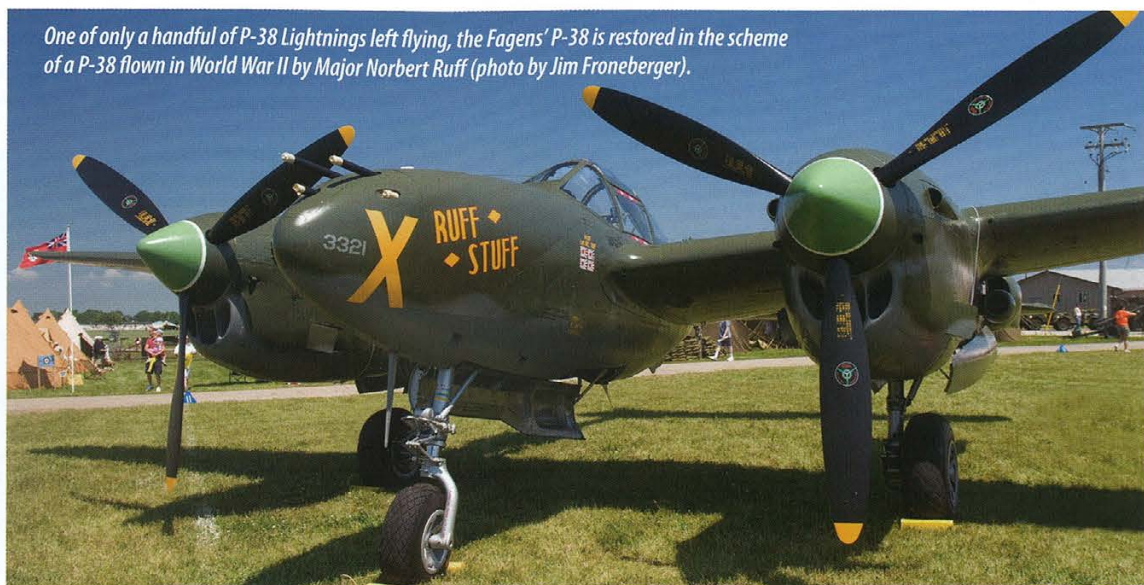
One of only a handful of P-38 Lightnings left flying, the Fagens' P-38 is restored in the scheme of a P-38 flown in World War II by Major Norbert Ruff.