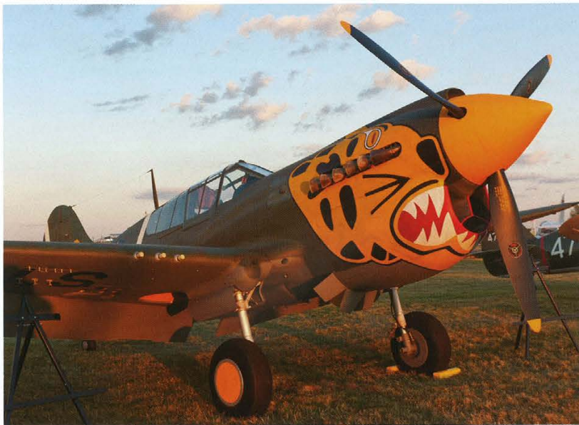
Left: Two more Fagen aircraft that have been crowned Oshkosh Warbird Grand Champions-World War II are the P-40K Warhawk(top) in 2013 and the P-51D "Twilight Tear" in 2011 (bottom).